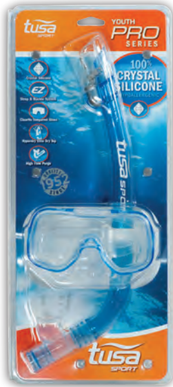
UC-2022 (CLB) Shown