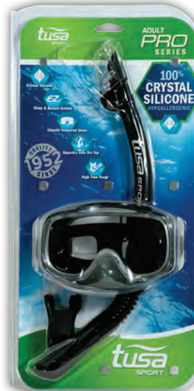
UC-3325 (BKBK) Shown