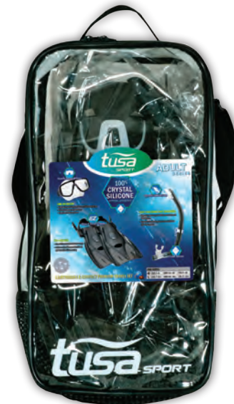
UP-2614 (BK) Shown