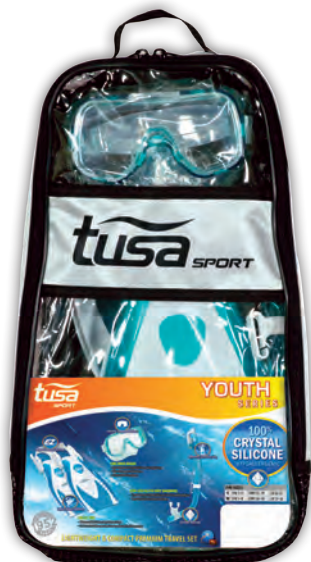
UP-2221B (GR) Shown

This style bag used for sets with UF-21 Fins (UP-2221B / UP-7221B)