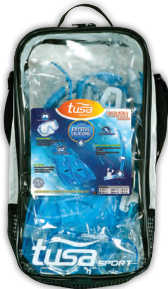
UP-2414 (CLB) Shown

This style bag used for sets with UF-21 Fins (UP-2221B / UP-7221B)